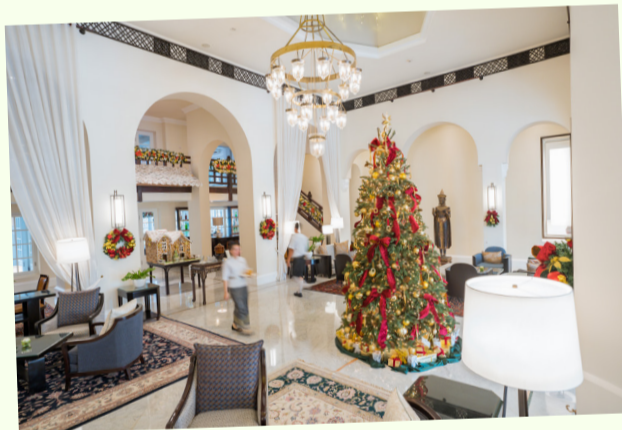
Raffles' Grand Lobby