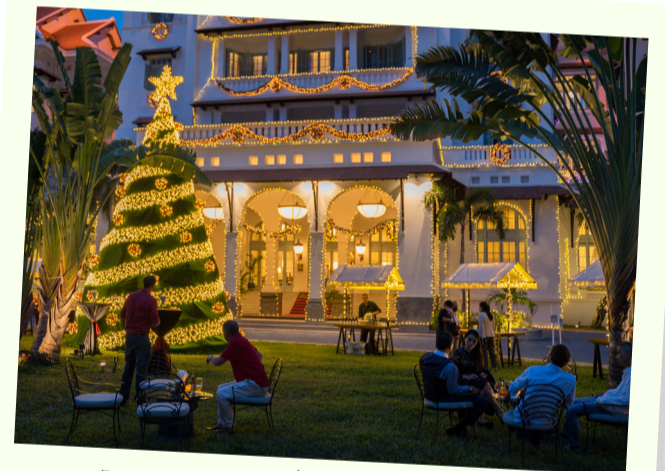
Raffles' Christmas Market