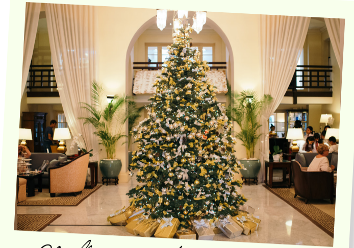
Noble Fir Christmas Tree

The festive season is the busiest time of the year at the Raffles. Gorgeous scenes and scents will welcome guests throughout the hotel. The hotel's grand lobby is a magical wonderland with an aromatic noble fir Christmas tree, beautiful decorations with ornaments, lights, and foliage