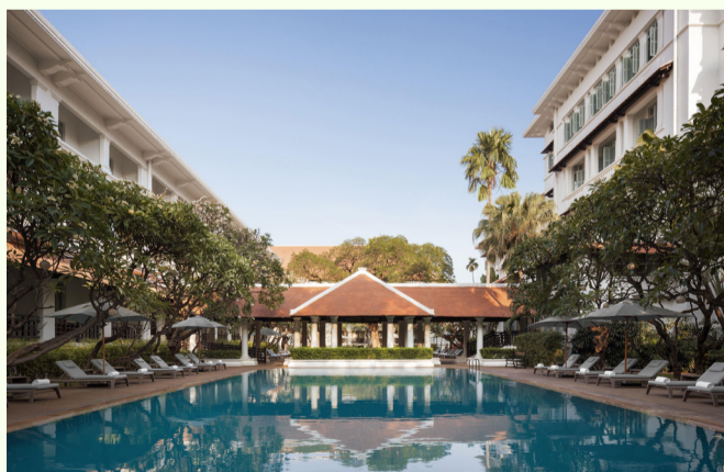
Staycation at the Raffles